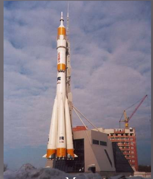
Museum 'Space Samara'

The museum Space Samara and the Rocket are the most famous tourist attractions nowadays.