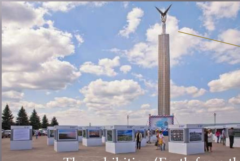
The monument of Glory

The exhibition 'Earth from the Air, 2002, the photographer Yana Bertran