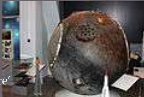
Exhibit in 'Samara Space'